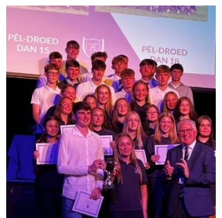
Sports Award Evening 2024