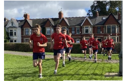
Cross Country 2024

We've enjoyed a busy fortnight, with students settling down well to school life. It was also good to see the tremendous levels of participation in our annual Cross Country race this week and the enjoyment and energy of all those who participated.